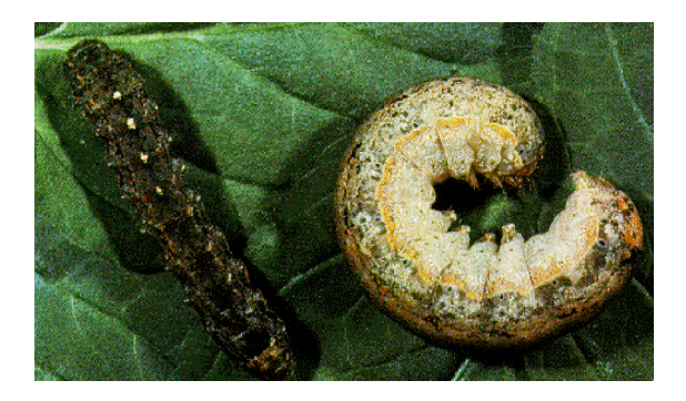
Variegated cutworm larvae

Cutworms are easiest to control when they are small. Fields should be checked regularly to detect the presence of small larvae so that applications of insecticides can be properly timed. Small larvae can be sampled with a sweep net and older larvae can be sampled by examining the soil surface or under trash. Take at least 10 sweep samples from several different representative locations in the field. Larvae feed at night and hide during the day, so sampling should be done early in the morning. For soil surface samples,