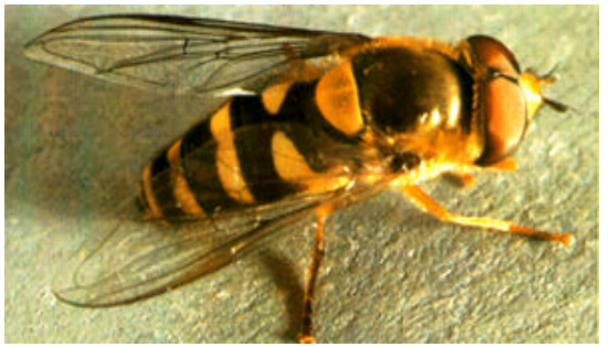
Syrphid fly adult

Larvae feed on soft-bodied insects, particularly aphids. As many as 400 aphids may be consumed by one larva during its development period. Larvae seize aphids with their mouth hooks and suck out the body contents. These predators are common in most field and vegetable crops and may be important in suppressing aphid populations if unnecessary applications of nonselective insecticides are avoided. Two common species of syrphid flies occur in the northwest: the western syrphid, Syrphus opinator and Scaeva pyrastri .