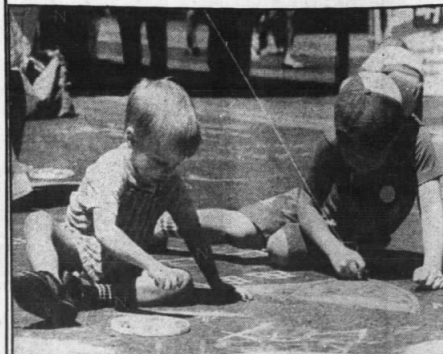
Children can create their own works of art on the streets of downtown Nashville during Summer Lights '89 June 1-4. The city's most popular outdoor event offers a tremendous selection of entertainment, visual art and hospitality for the whole family.