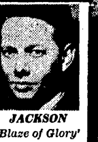
JACKSON 'Blaze of Glory'

POP-FOLK duo, Indigo Girls, grabs the number one spot on Tower Records' top-selling album list, with its debut album.