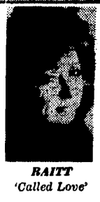
RAITT 'Called Love'

TOM PETTY hits WBCN's most-requested singles chart twice with "I Won't Back Down" and "Running Down a Dream" from his album, "Full Moon Fever."