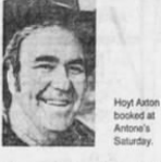
Hoyt Axton booked at Antone's Saturday