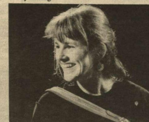
● SHARON SHANNON

Mary Black has become one of the very biggest attractions in popular music today, with her concerts in the Albert Hall and elsewhere selling out almost as soon as they're announced. It's a richly deserved success, as Mary has one of the finest and most beautiful voices you'll ever hear, and her latest release "The Holy Ground" amply confirms her genuine super-star status. You can catch Mary - if you can get a ticket! - in Leisureland at 8.00 p.m. on Sunday evening.