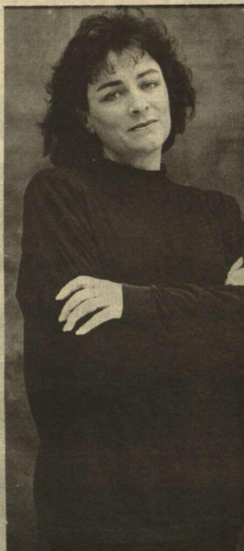
● MARY BLACK