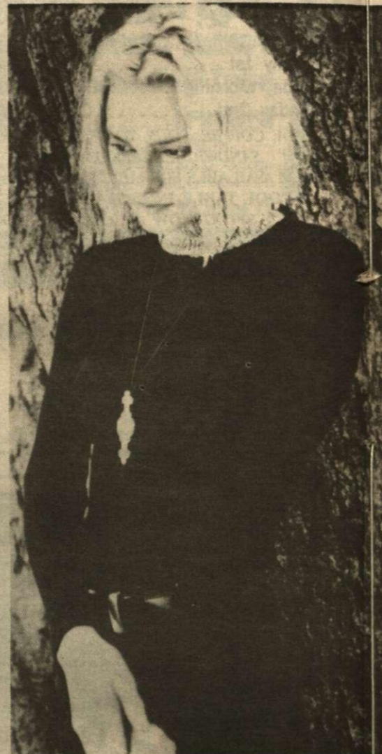
● AIMEE MANN

Townes Van Zandt has already made a bunch of new fans in Galway through his recent performances here. His best known song is still probably the tale of