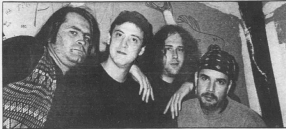
Surfing the Coal dust At the Exit/In Wednesday