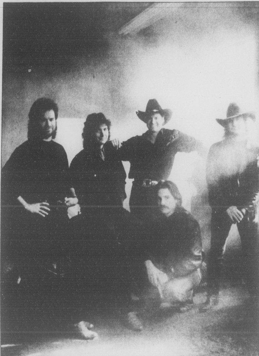
Restless Heart opens for Kenny Rogers Tuesday at the Air Force Academy. Showtime is 7:30 p.m. at the fieldhouse.

tino, contemporary French and Italian music, Cameron Church, 1600 S. Pearl St., Denver, 8 p.m., $12 by calling (303) 777-1003.