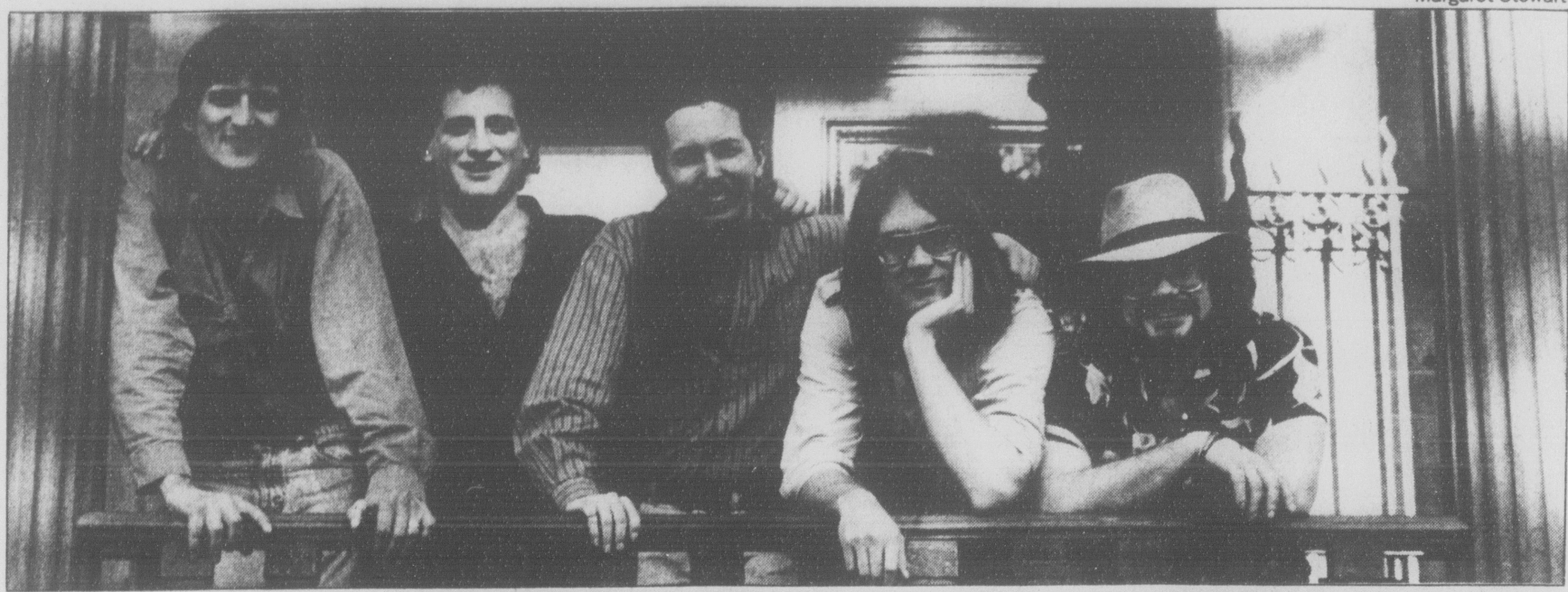
Max Creek — a Connecticut-based band specializing in bluesy, psychedelic-influenced music — plays tonight at the Club House.