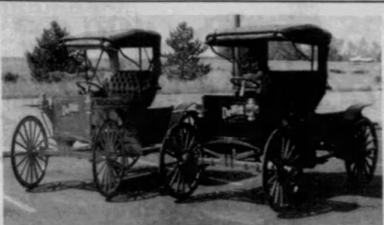
Replicas of antique cars will be displayed at Bawcom's Roundup Antique Show this weekend.