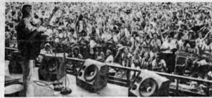
The Kerrville Folk Festival will celebrate its 10th anniversary with two weekends of music.