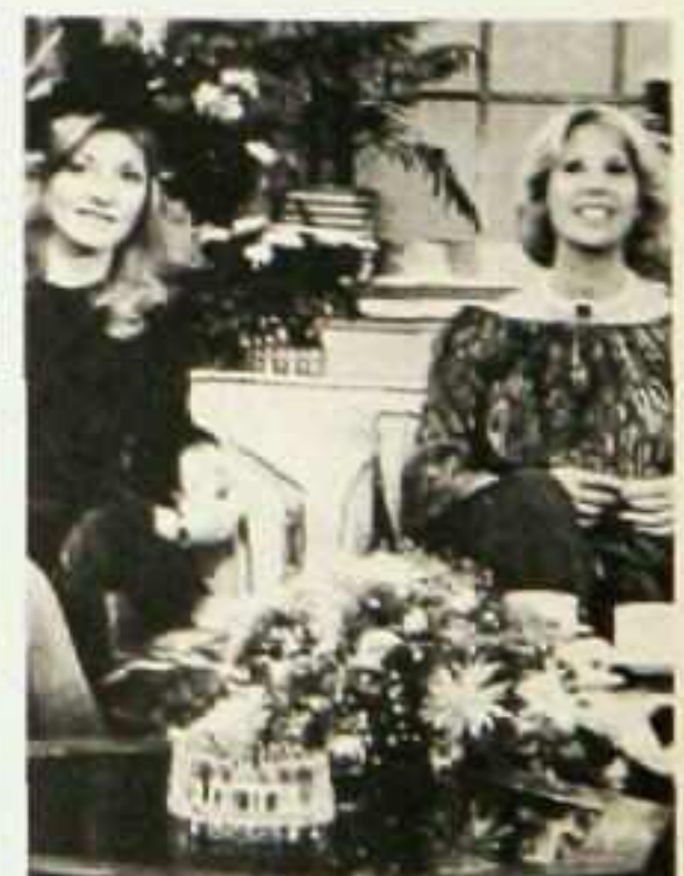
CUE TIME —Stella Parton, left, and Dinah Shore wait for a cue as taping begins for the Elektra artist's segment of the "Dinah!" show.