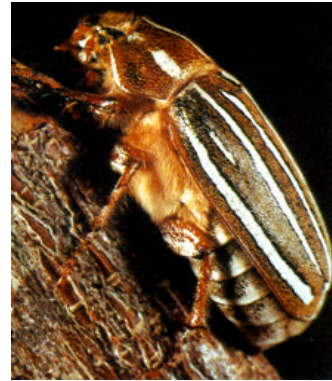
Adult "June" beetle

Adults are called "June beetles" or "May beetles" and are about 20 to 35 mm long. Adults are dull or metallic and the antennae end in a club with moveable plates. In the West, tenlined June beetle , Polyphylla decimlineata and coastlined June beetle , Polyphylla crinita , have the dorsum covered with yellowish and white scales arranged in longitudinal stripes on the head, pronotum, and wing covers. The June beetle , Phyllophaga anxia , is found in the northwest and is shiny reddish-brown and about 18 to 21 mm long. Larvae of the carrot beetle , Bothynus gibbosus also damages tubers. Larvae are called white grubs and are 25 to 50 mm long when mature. Larvae are "C-shaped" with a brown head and three pairs of prominent legs on the thorax.