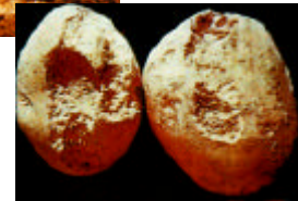
White grub larvae and damage on tubers