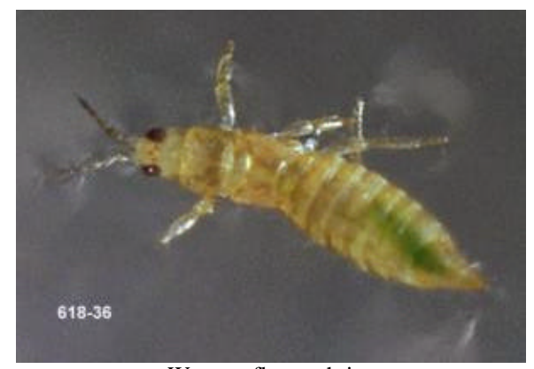
Western flower thrips

The most commonly used method of controlling thrips is the use of insecticides. Thrips populations can be monitored in fields or greenhouses with yellow or blue sticky cards. The best method of preventing thrips infestations in greenhouses is to screen all vents and doors and avoid bringing infested plants into the house. Predators such as lacewings and minute pirate bugs are important late in the growing season, and may prevent thrips from increasing to larger populations.