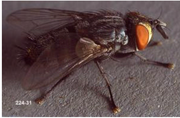
Tachinid parasite adult and larva (below)

This is a large group of beneficial flies in which the larvae are parasitic on numerous destructive pests. The benefits of these parasites are difficult to estimate, but they undoubtedly play a major role in suppressing populations of many insect pests. In the northwest, tachinids are important parasites of several species of cutworms including variegated cutworm, western yellowstriped armyworm, zebra caterpillar, alfalfa looper, Colorado potato beetle and others. Tachinids also parasitize codling moth, corn earworm, tussock moth, hornworms, imported cabbageworm, grasshoppers, and plant feeding bugs. Compsilura concinnata was released in the northwest to control satin moth and is now commonly found parasitizing tent caterpillars.