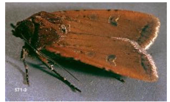
Redbacked cutworm adult.