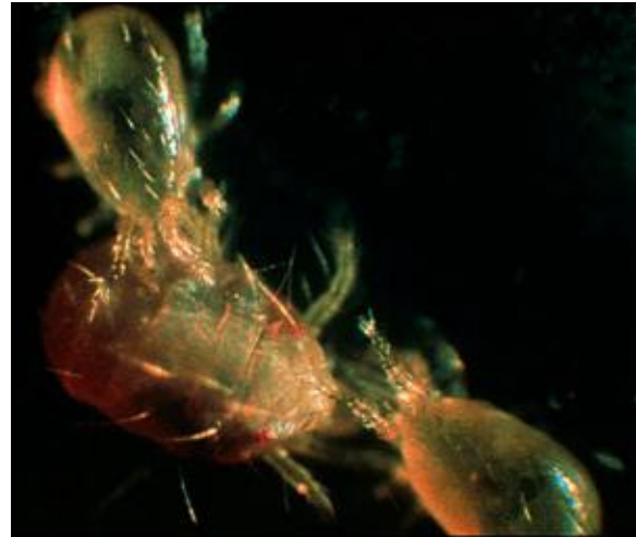
Predator mites feeding on twospotted spider mite

Female predator mites produce about the same number of eggs as the prey. This phenomenon reduces the lag of predator populations behind those of the prey, and may account for the effectiveness of many mite predators in integrated pest management programs. Also, the predators respond quickly to increasing abundance of prey, resulting in the ability