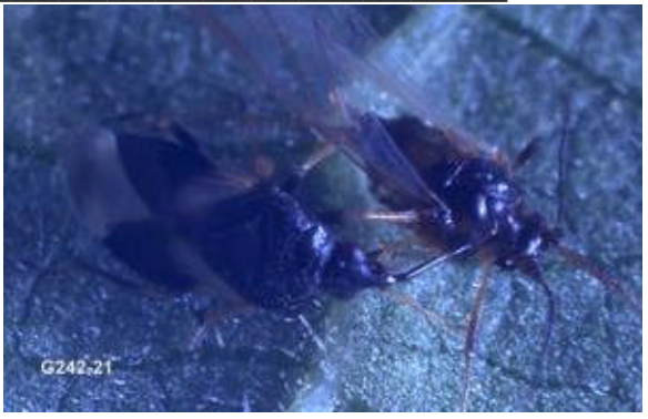
Minute pirate bug adult

Adults and nymphs are very active predators and may be found on all aerial parts of plants. Active stages feed by sucking the body fluids from aphids, spider mites, thrips, insect eggs, and immature stages of many small insects. They are particularly effective predators of thrips and spider mites. Adults and immature stages may consume more than 30 spider mites per day.