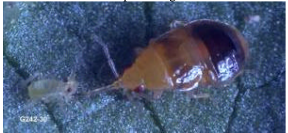
Minute pirate bug nymph