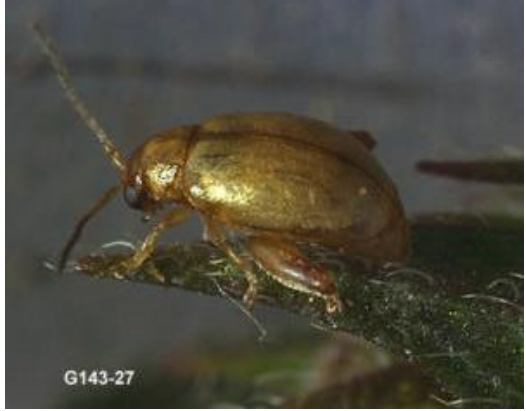
Mint flea beetle adult.