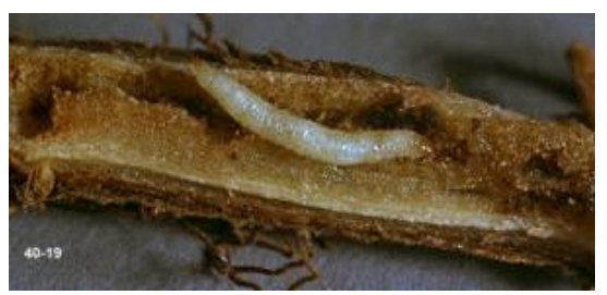
Mint flea beetle larva.

Planting infested rookstock is the principal way new mint flea beetle infestations are established. Perhaps the best management practice is to only plant certified flea beetle-free rhizomes. Recognition of adult flea beetle feeding damage on leaves is the easiest way to determine if this pest is present. A