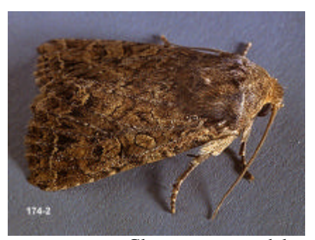
Glassy cutworm adult