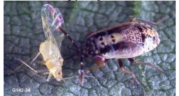
Bigeyed bug nymph