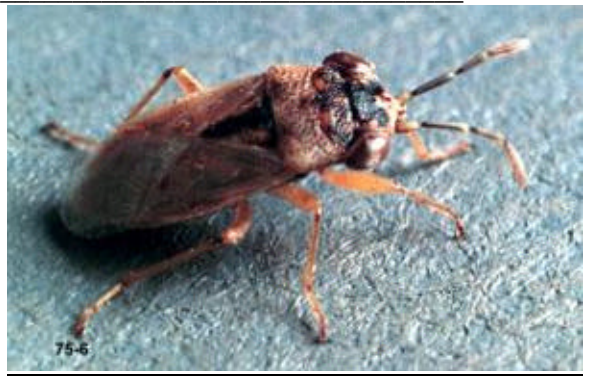
Bigeyed bug adult

Adults and nymphs feed by sucking the body fluids from their prey. Both are effective predators of lygus bug nymphs, aphids, leafhoppers, and spider mites, although smaller nymphs prefer to feed on aphids. Bigeyed bugs may play a major role in suppressing pest populations in several crops, particularly seed alfalfa, mint, and potatoes, if unnecessary applications of insecticides are avoided.