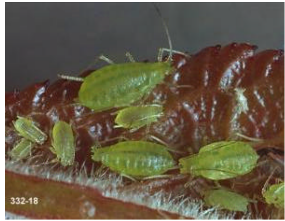
Mint Aphid Colony

The mint aphid population can be estimated by using a sweep net during the same time as sampling for other mint insects. In most years and in most production areas, naturally occurring predators such as lady beetles, lacewings, and syrphid larvae suppress the population. Parasites, which aid in the suppression of mint aphid, also may be present in some fields. Since populations are usually controlled naturally, insecticides are seldom needed to control this pest.