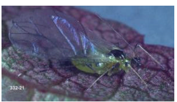
Winged Mint Aphid