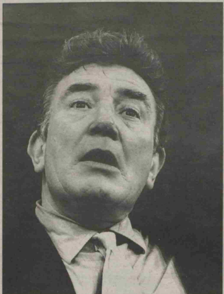
Albert Finney takes up one of the three roles in Art by Yasmina Reza, opening at Wyndham's in October