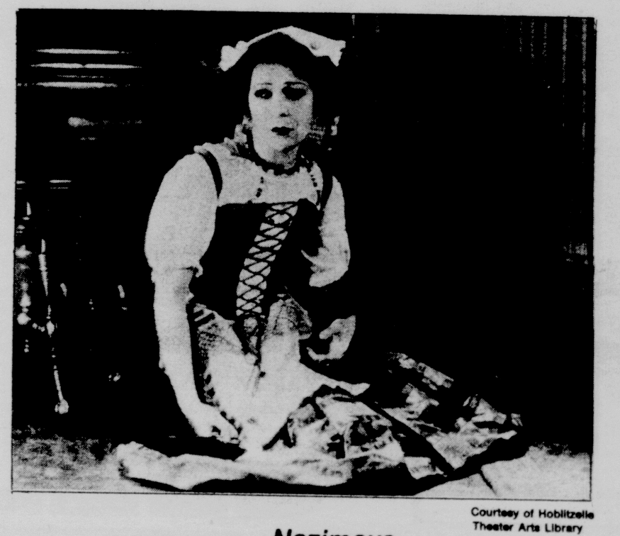
. . . Nazimova