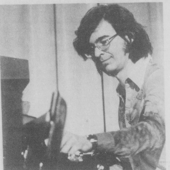
-Texan Staff Photo by David Woo