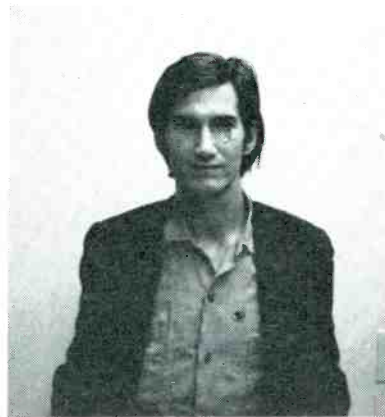
Townes Van Zandt

NEW YORK — Townes Van Zandt is a catchy name that, once heard, finds its own special place in your mind. Townes himself is a folk musician whose songs are an accurate reflection of his interesting name.